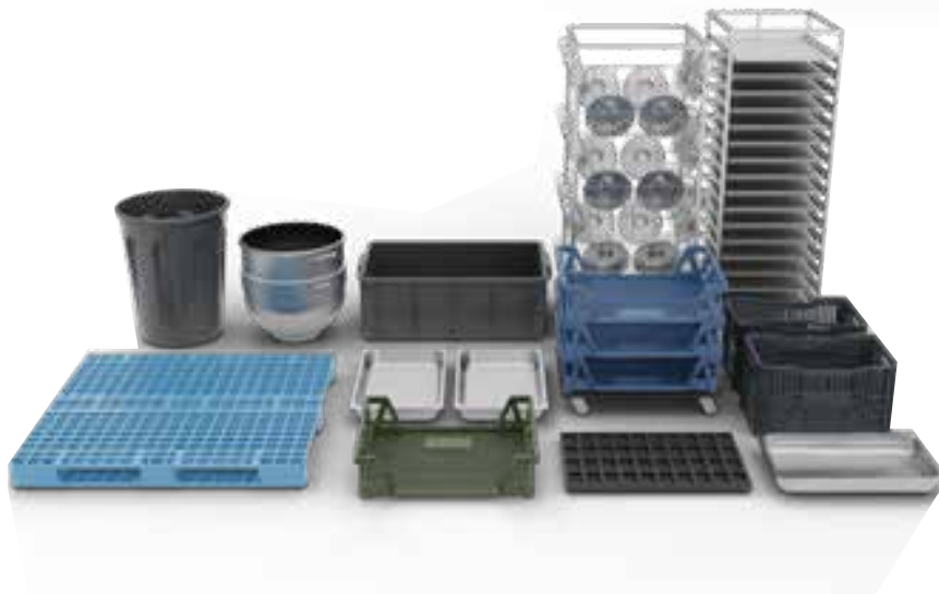
Multi Products Washing