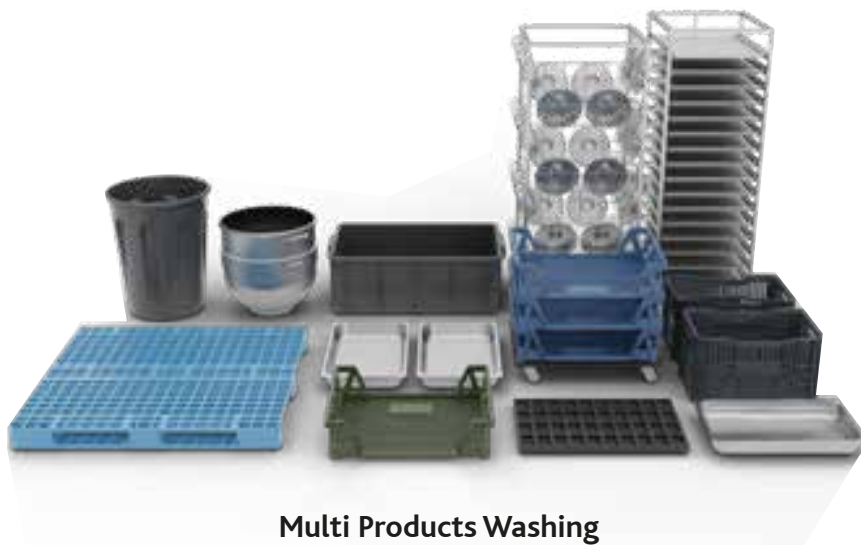
Multi Products Washing